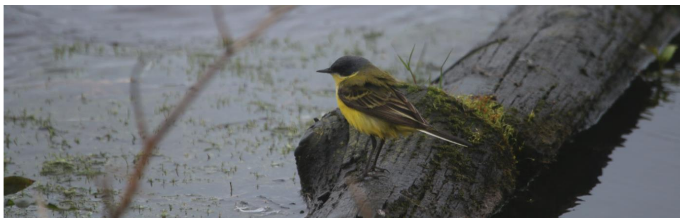
Grey-headed Wagtail, Moorey Mere 2021.

One found at Moorey Mere (FB) on 21 st May lingered until the 22 nd . This is the first record for the island.