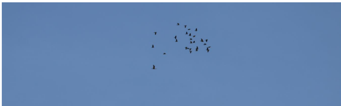
Glossy Ibis below flock of jackdaw, North Valley 2021.