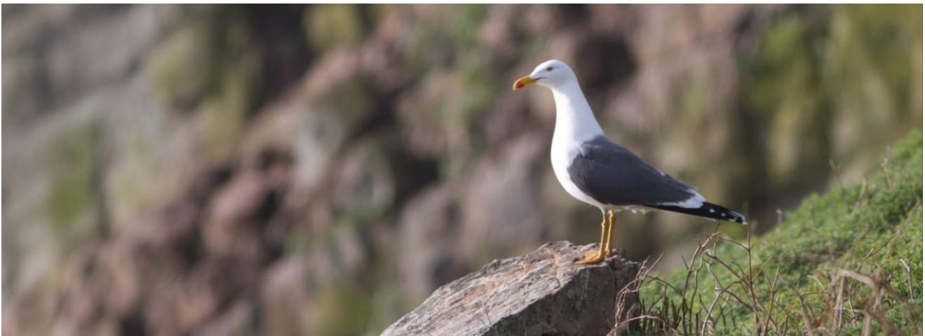
Lesser Black-backed Gull, South Stream 2021.

The whole island population estimate was 7,412 AON which is 3.34 % lower than 2020. Productivity of 0.67 chicks per AON is higher than 2020 (0.24) and is the highest since 2015.