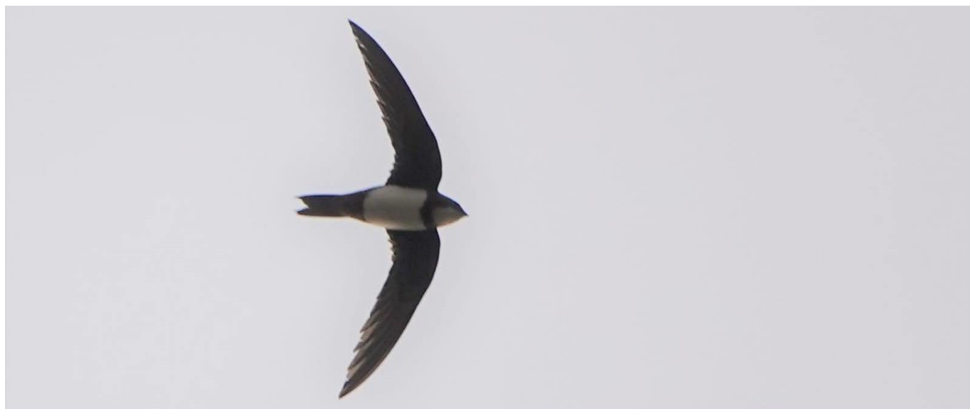
Alpine Swift, Central Fields West of Farm 2021.

Stone. It was re-found later in the afternoon feeding above the Farm and spent the rest of the day feeding west of the Farm.