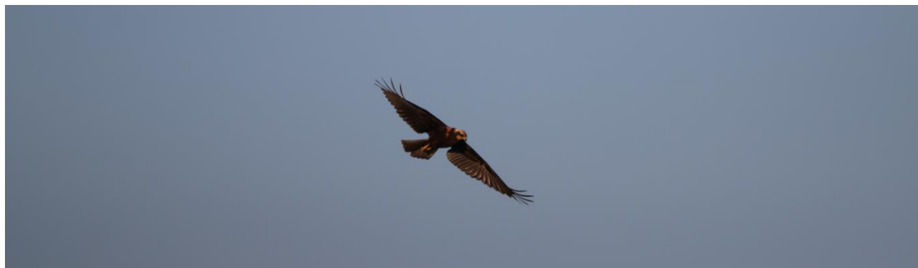
Marsh harrier, North Pond 2021.

Wing-tagged IL – ‘The bird has been loitering around the Pembrokeshire coast since 19.11.2020, when it was seen on Castlemartin Corse, then floating between there and Marloes Mere until 22.02.2021. The bird was ringed and tagged near Thorpe Haddiscoe in South Norfolk on 07.06.2020, and was one of four young (3 Male 1 Female). He was first seen near Felixstowe on 30.10.2020, before heading west. His sister was in Northamptonshire on 09.09.2020 and a brother in north Norfolk on 24.11.2020.’