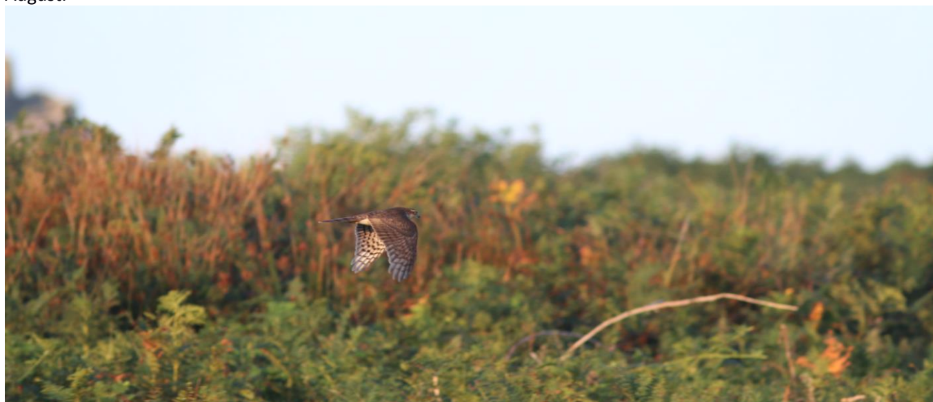
Eurasian sparrowhawk, East Bog 2021.

The first of the year arrived on 17 th March, with further singles seen on 28 th and 29 th March. Sightings were sporadic throughout spring, with singles seen on 10 more days in April and May. The first bird of the autumn was seen on 13 th July with sightings again sporadic through until 21 st August when two birds were seen. From there onwards birds were seen most days until departure in November with a high count of four on 31 st August.