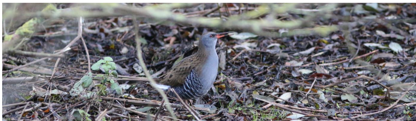
Water rail, Moorey Mere 2021.

First noted on 2 nd March when three were recorded. Birds were present for most of March with the last record of likely wintering birds being on 24 th . One bird was recorded on 15 th May and no other birds were recorded until autumn. The first migrants of autumn were recorded on 25 th August with sightings nearly every day until departure in November. The high count of the year was 15 on 7 th November.