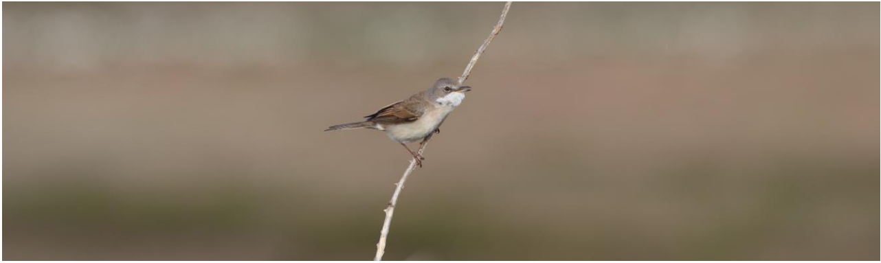
Common whitethroat, The Farm 2021.