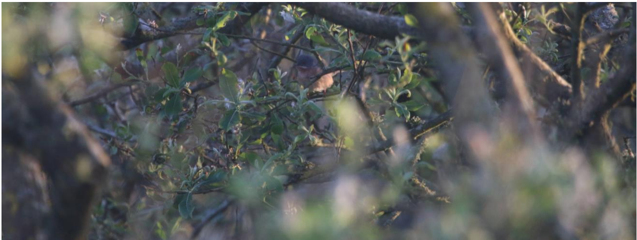
Western subalpine warbler, North Valley Willows 2021.

A male was found in North Valley Willows on 30 th May (DA), although views proved tricky with the bird being very shy. If accepted (in circulation) this will represent the first record of a Subalpine Warbler since 2018.