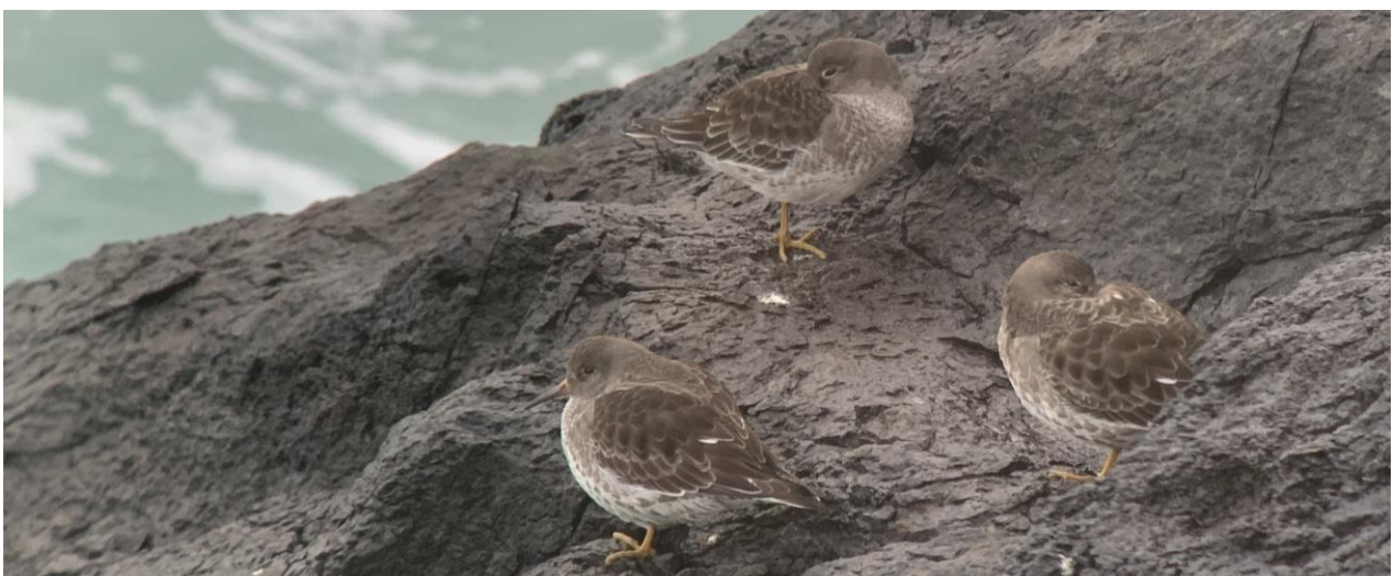
Purple Sandpipers, South Castle 2021.

Noted on three consecutive dates in November at their roost site on South Castle. Seven were present on 12 th , five on 13 th and four on 14 th .