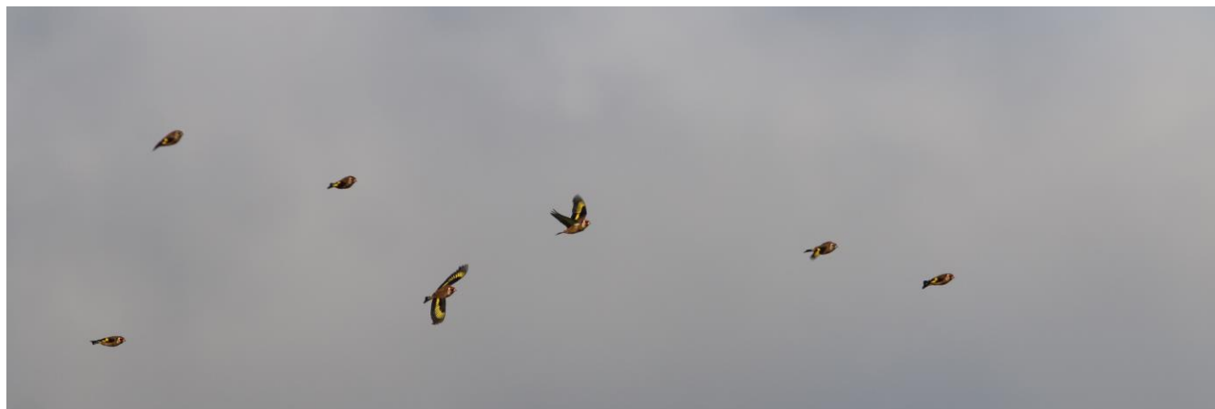
Goldfinch migrating, the Wick 2021.

Migrants started to arrive during July with 10 on 8 th being the first sign of movement. The highest count of the month was 20 on both the 12 th and the 27 th July. Between one and 20 were recorded on most days in the autumn, with counts above this as follows: 29 on 23 rd and 22 on 29 th August, 25 on 6 th , 149 on 10 th , 22 on 11 th and 38 on 13 th October and 21 on 10 th and 11 th November. The final sighting of the year was one bird on 17 th November.