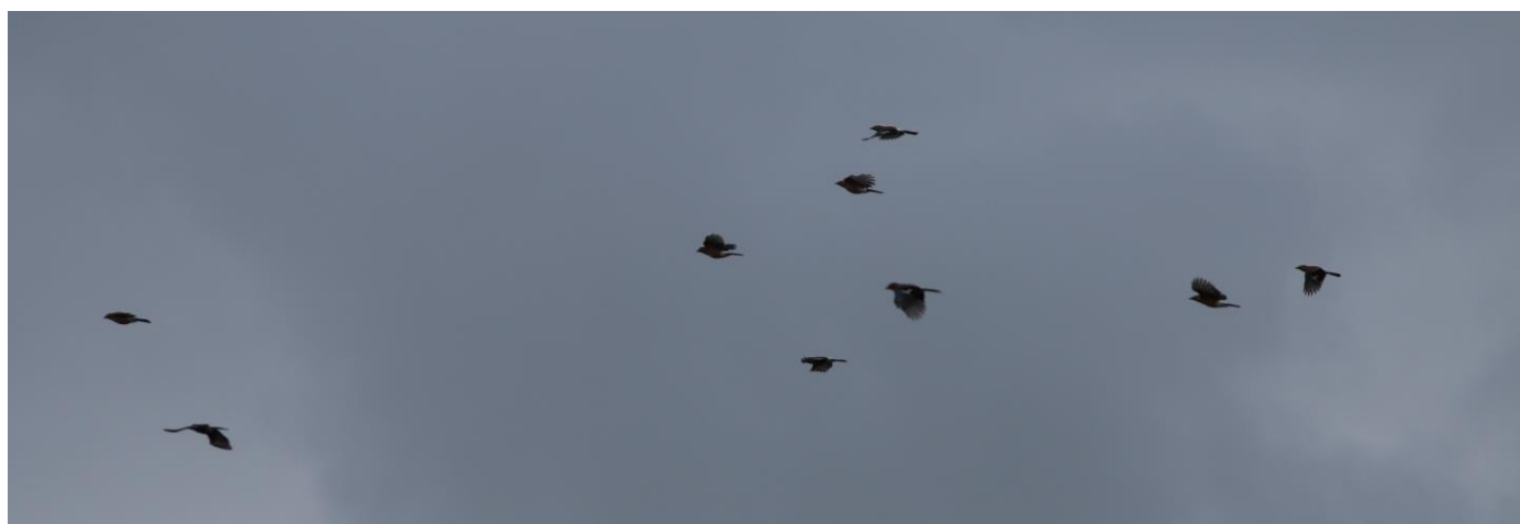
Jay flock, North Haven 2021.

A record year for Jay with four days' worth of records consisting of 110 birds. The first birds were noted on 29 th September with seven at North Pond. There was a single bird on 30 th September with the largest numbers on 6 th October with 101 birds. The only other record was of one bird on 8 th October.