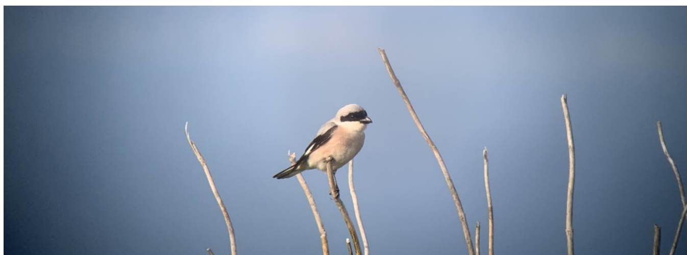
Lesser Grey Shrike, Well Field 2021.