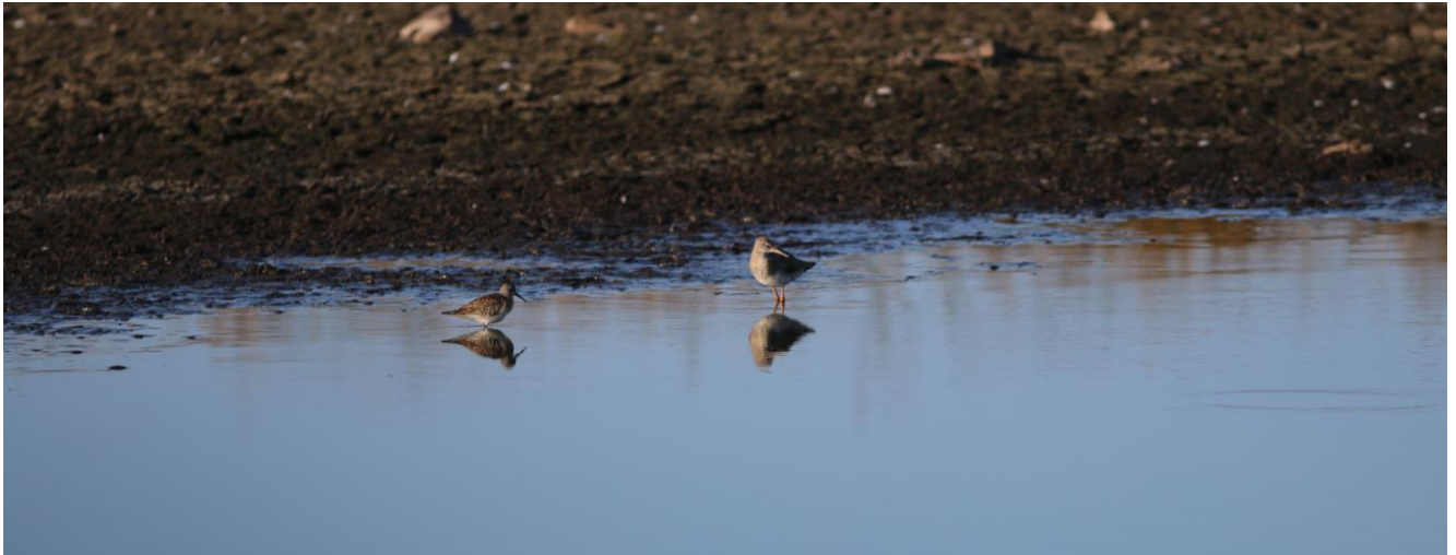
Curlew sandpiper with redshank, North Pond 2021.