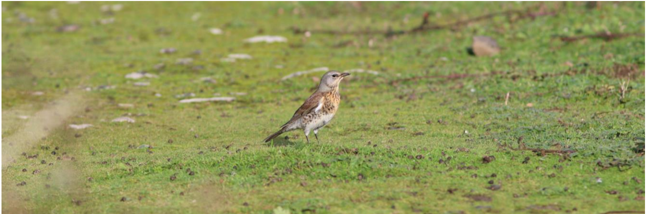
Fieldfare, the Farm 2021.