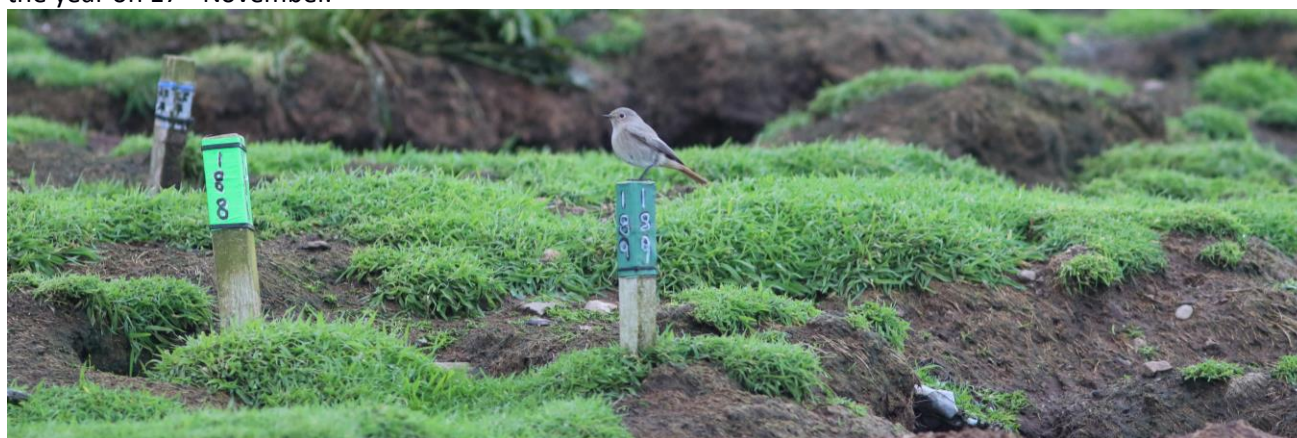
Black Redstart, North Haven 2021.

Autumn birds were first recorded on 12 th October with one at the Farm, shortly followed on 14 th by two at the Farm. Black Redstart was recorded on seven more days in October with high counts of three on 24 th and 30 th . Three were also recorded on 1 st November with six more days with sightings including the last record of the year on 17 th November.