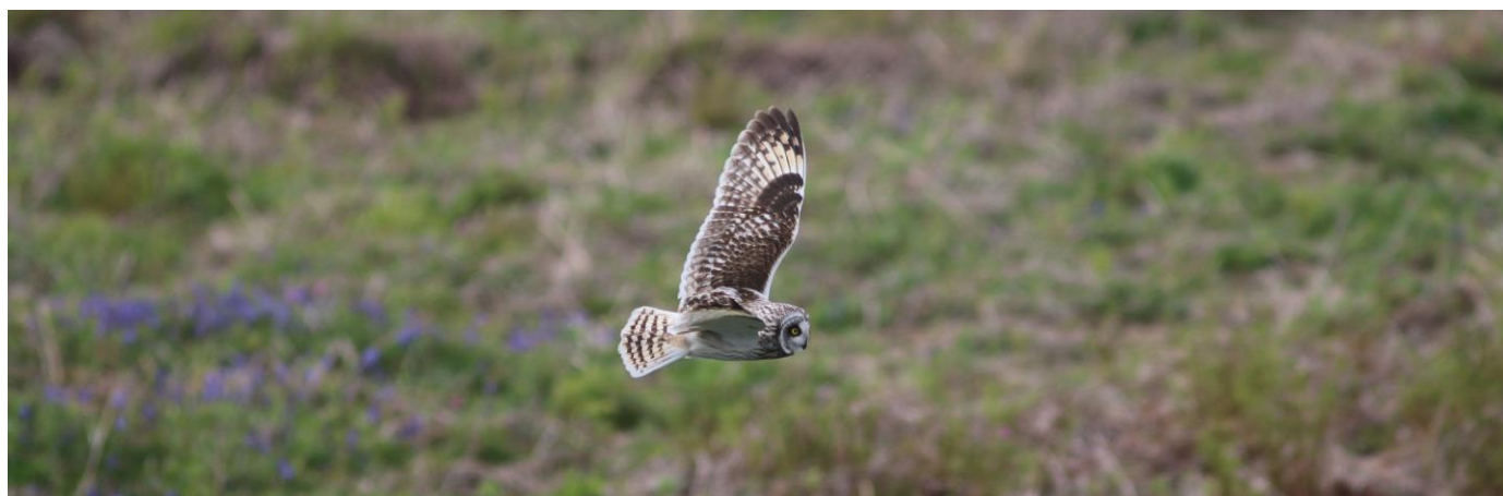
Short-eared owl, North Valley 2021.

There were no noticeable increases in autumn numbers and evening roost counts resulted in few if any short-eared owls. The maximum count from the autumn was two in North Valley on 21 st September. Birds were sporadically recorded until the Warden's departure from the island.