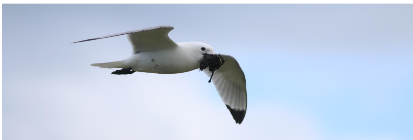
Kittiwake carrying nesting material, the Wick 2021.

Large movements in the autumn include 541 on 20 th , 342 on 21 st , 133 on 22 nd and 856 on 25 th October.