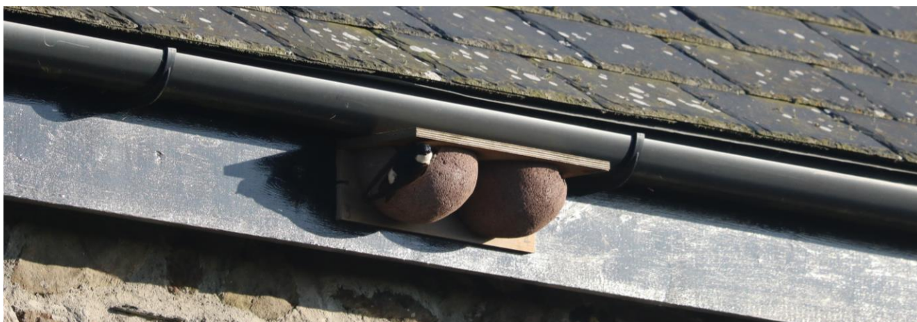
House Martin, The Farm 2021.

On 7 th June two birds were seen prospecting for nest sites at the Farm. These two birds continued to prospect and chose to nest in the artificial nest box above the Visitor Centre. Sightings of both birds became less regular from 17 th June indicating incubation. The first chicks were confirmed on 12 th July with two chicks fledging on 3 rd August. This appears to be the first breeding record since 1970.