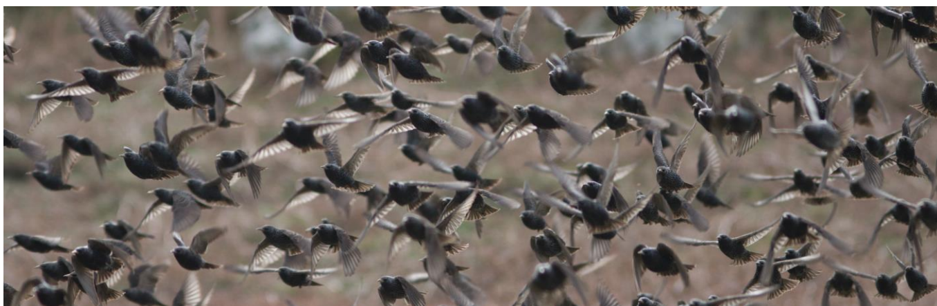
Starling flock, The Farm 2021.